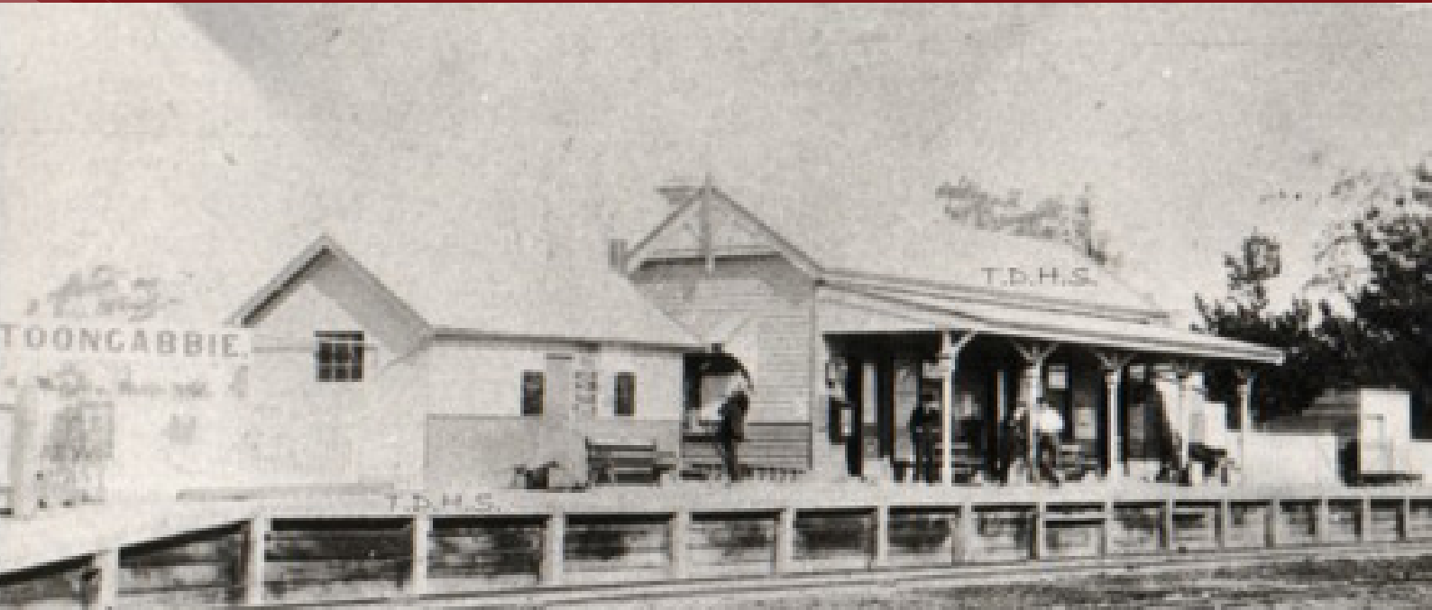
Image: Four men standing on the platform of the Toongabbie Railway Station, in front of the booking office.