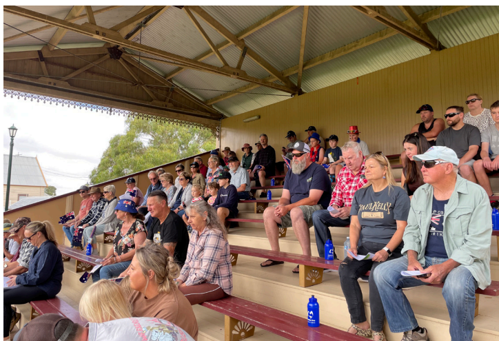
Pictured: Locals attending Australia Day 2026

Cassandra is a firm believer that we all have the ability to make wonderful, positive changes in the world around us. Our actions don't have to be enormous; they just need to have heart.