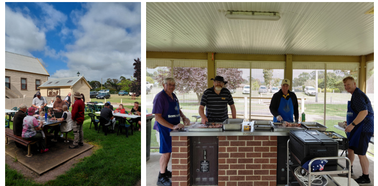
Pictured: Australia Day Toongabbie 2026, Our Local Lions Team