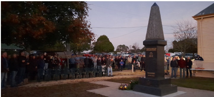
Pictured: ANZAC Dawn Service 2025