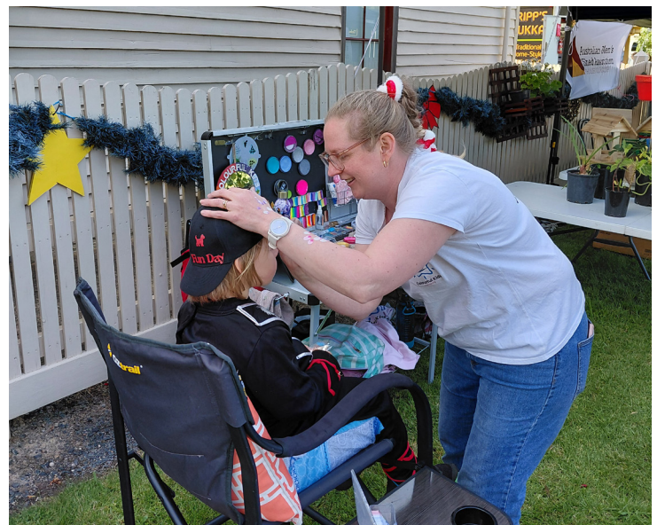
Pictured: Face painting organised by the TTG