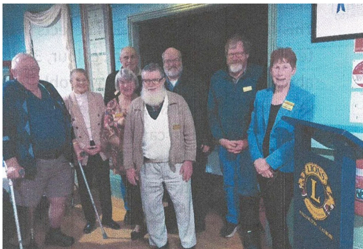
LIONS CLUB OF WELLINGTON/LATROBE THE NEW BOARD FOR THE 2025/26 LIONS YEAR.

You will still find us at the Glengarry Market each month with our sausages and bacon/eggs - even when it is freezing! This is our main source of income and enables us to donate to local organisations like the school, scouts, Mechanics Institute, hospital, Need for Feed, BlazeAid, many Lions projects and any disasters in the state, country & the world - plus more! Every