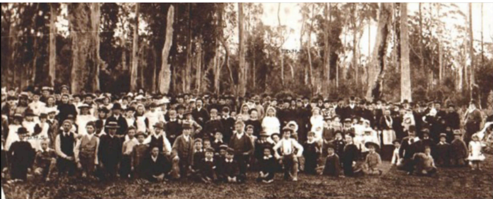
A very large crowd of men, women and children at the Toongabbie West picnic, held on 24th May 1893. They are in a cleared area surrounded by tall trees and bush.

Article credit: The Cowan Family Toongabbie By Vera O'Mara – July 1983