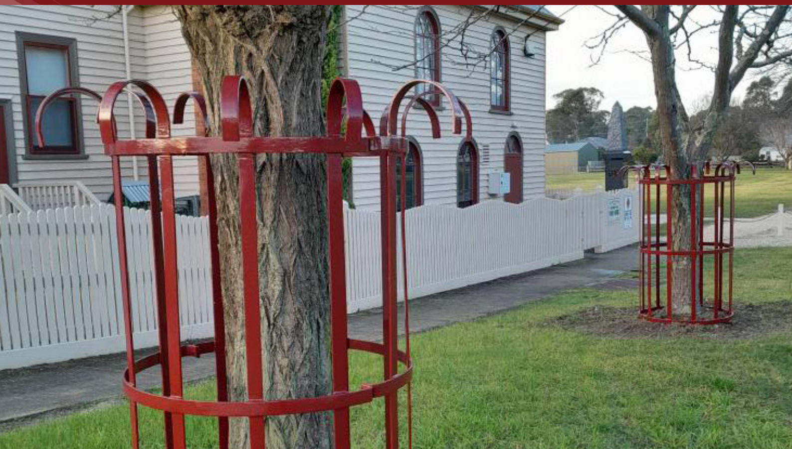
Image: New tree guards