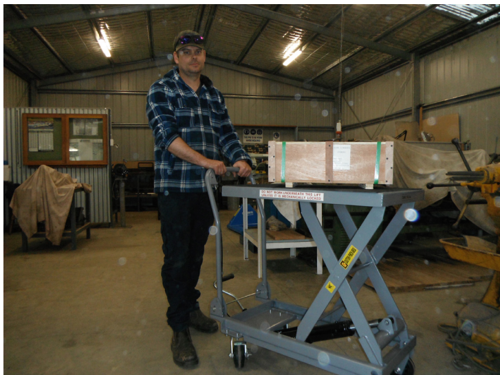
Pictured: Lift table in use