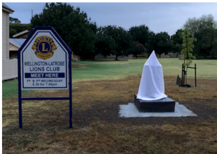
Image: AI generated as a visual representation of upcoming unveiling

Attendees are welcome to lay a wreath at the new cenotaph.