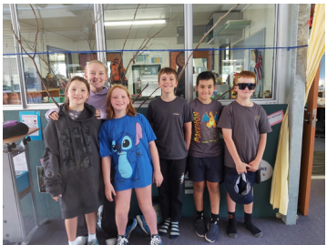
Our interschool swimming team