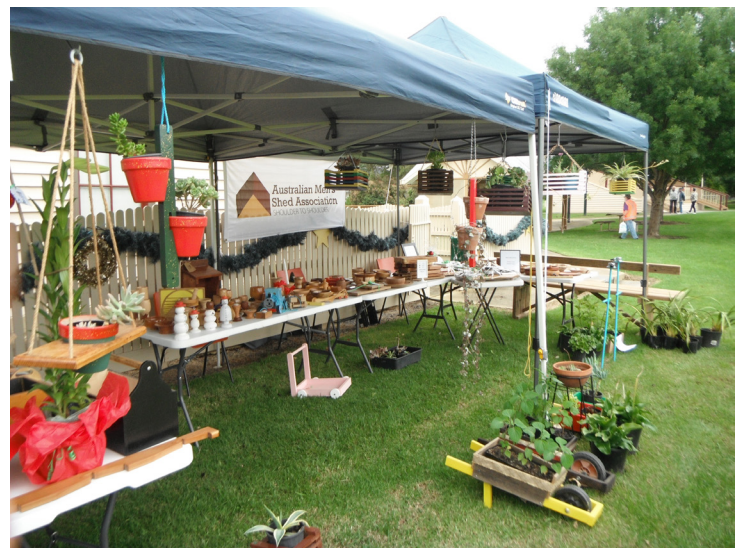
Pictured: Twilight Market 2024

For more information, please contact Colin on 0427 489 349.