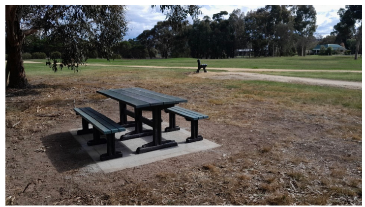
Picnic table located at the Wetlands

We again held a 'sausage sizzle' on November 25th at Bunnings Traralgon. Funds from these days also help to support us with our endeavours.