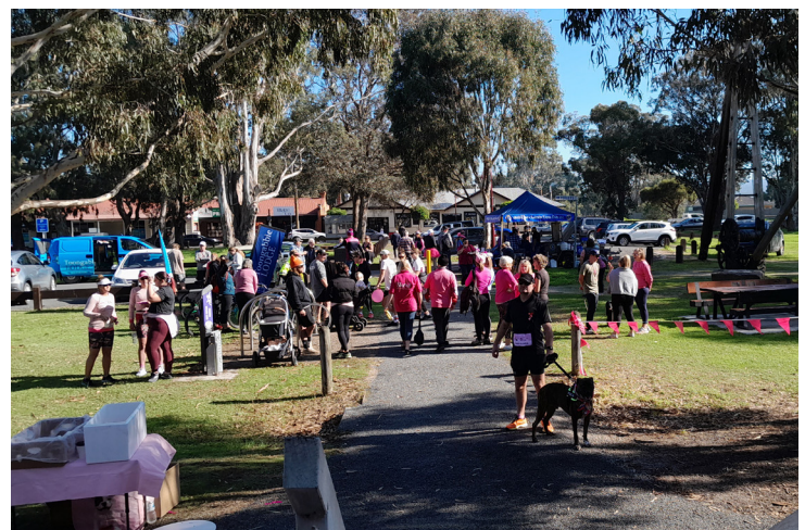
View from Glengarry Platform