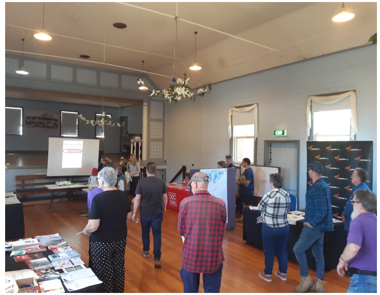
Pictured: Community Bushfire Management Expo

Achievements of the TTG in 2022 included: