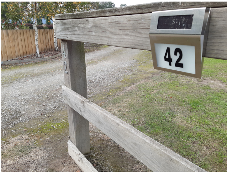
Pictured: Solar Light Program