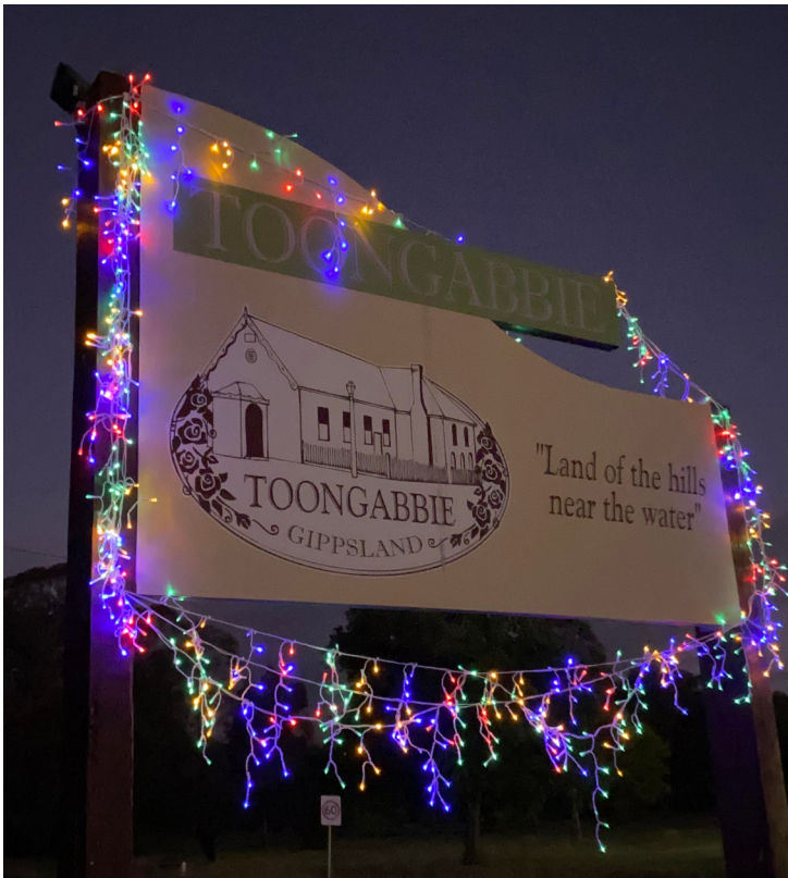
Pictured: Christmas Light around town