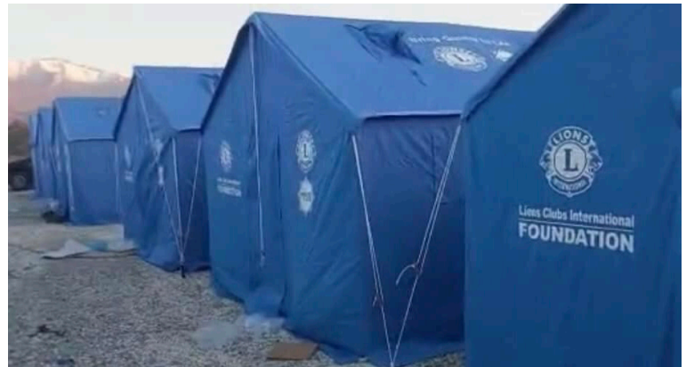
A Lions Tent City in Turkey

As Lions are proud to say "WHERE THERE'S A NEED, THERE'S A LION!"