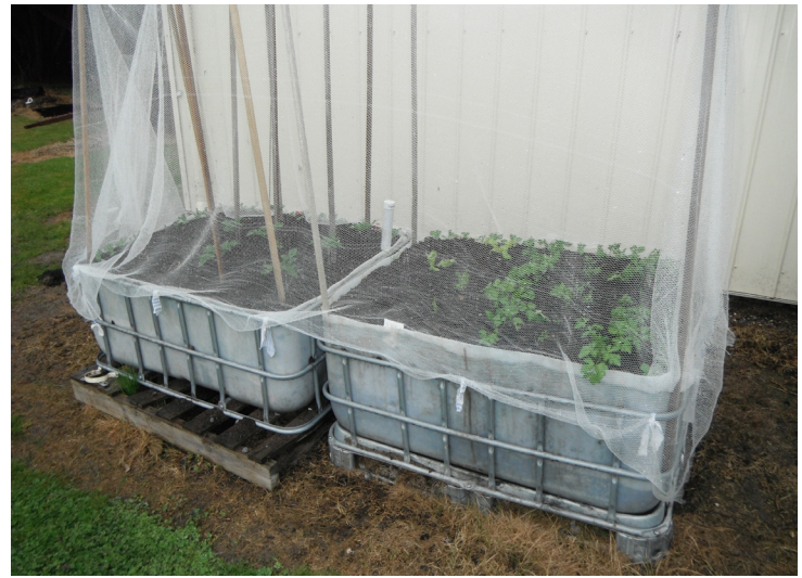
Pictured: Self watering garden beds