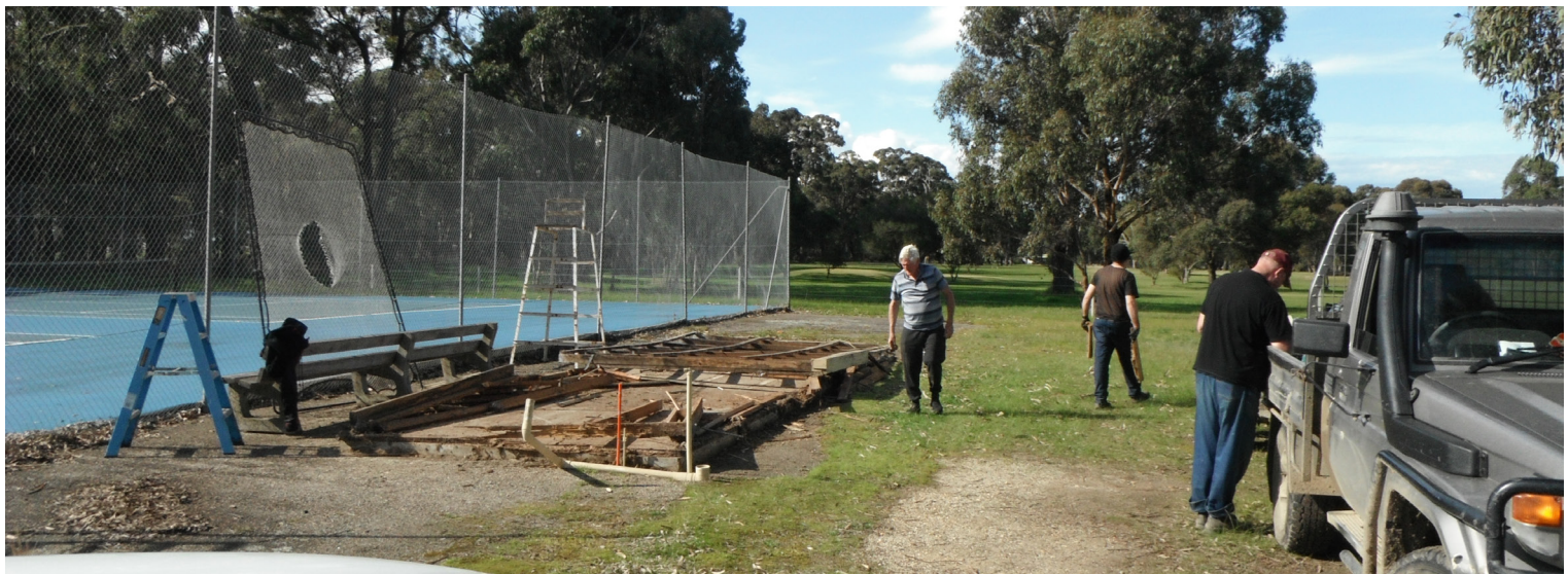
Pictured: Demolition of old tennis shed.

The members of the Newborough Men's Shed generously donated two self-watering garden beds that they have been constructing and transported and set them up at our Shed, as well as funds to purchase seedlings to plant in the beds. Members have planted vegetable seedlings and seeds in the beds and we look forward to plenty of vegetables to share.