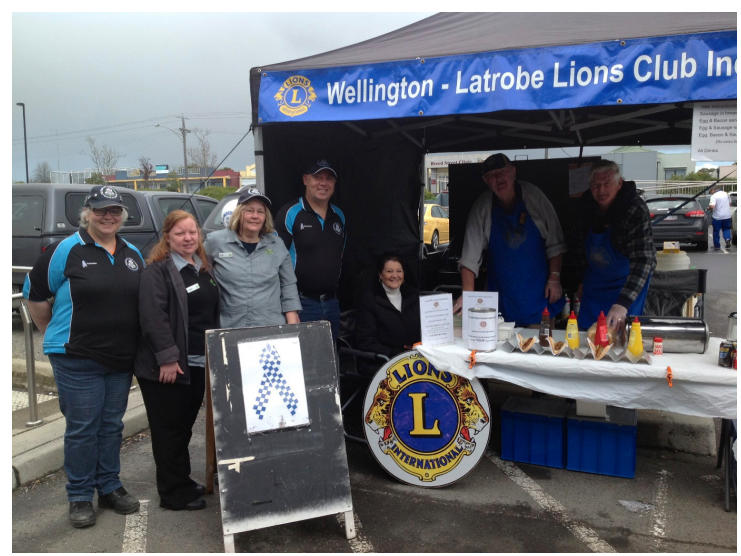
The BBQ crew in full swing supporting the Blue-Ribbon Appeal, in the picture are the staff members from Woolworths Traralgon, with Lions in the shadows cooking up a storm