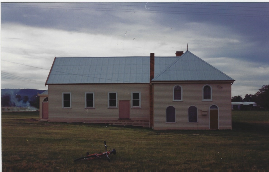
Toongabbie Mechanics Institute building 1994