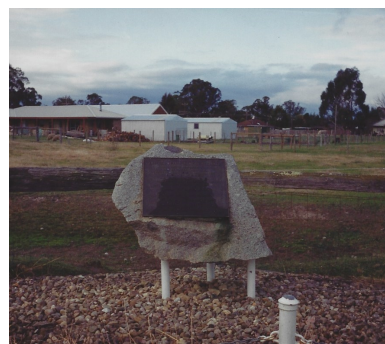
Ned Stringer Memorial 1994

I also discovered a few photos taken back in 1994, of the Toongabbie Mechanics Institute and Stringers Memorial. Photos of the Mechanics Institute taken shortly after the major restoration works had been completed and prior to the paling fence and garden being constructed. You will be able to spot a few differences in the photos on the back page..