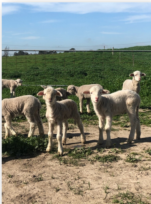
2019 Spring lambs photo taken on the Paulet family property—"Millring".